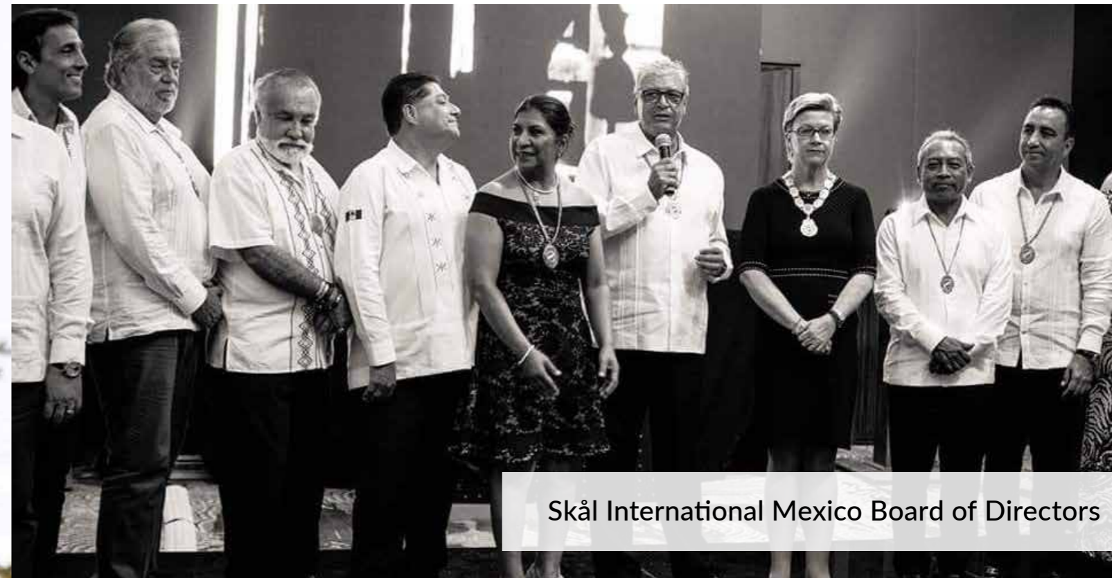
Skål International Mexico Board of Directors