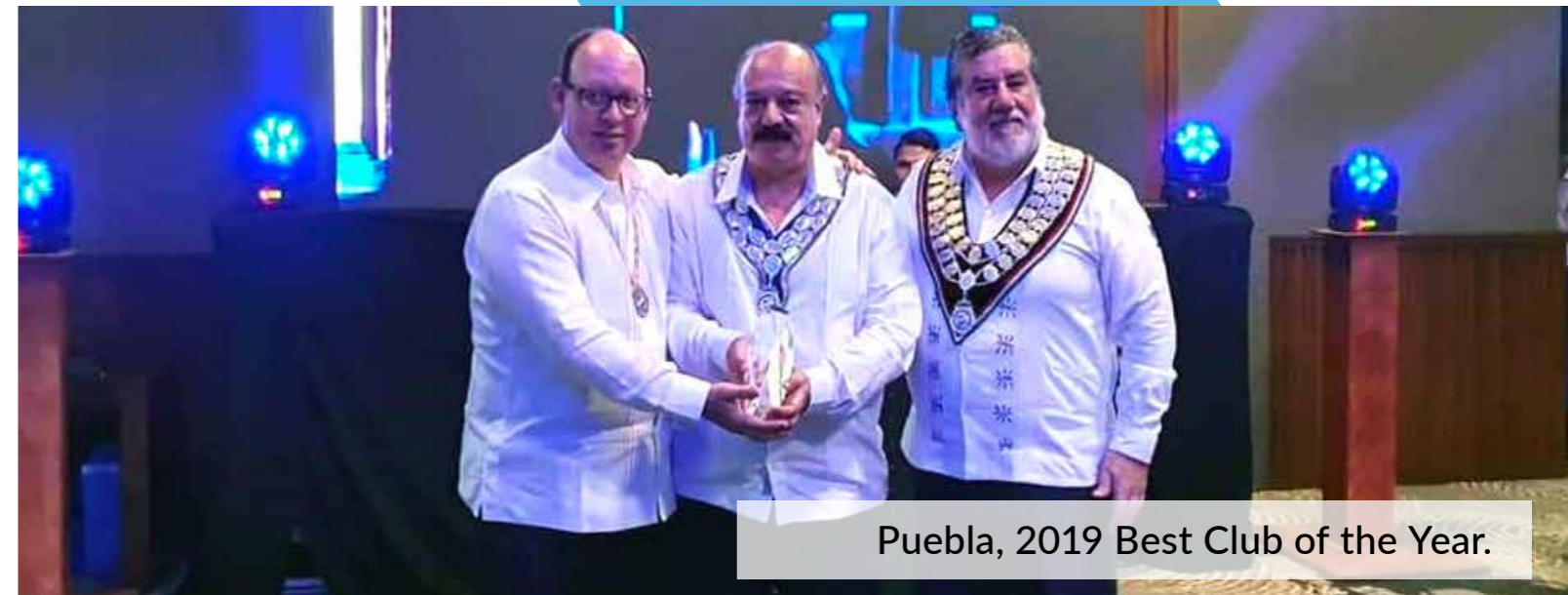
Puebla, 2019 Best Club of the Year.