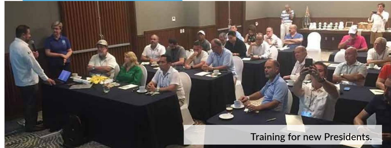
Training for new Presidents.

Skål International Mexico celebrates 70 years since the foundation of the first Skål Club in Mexico City