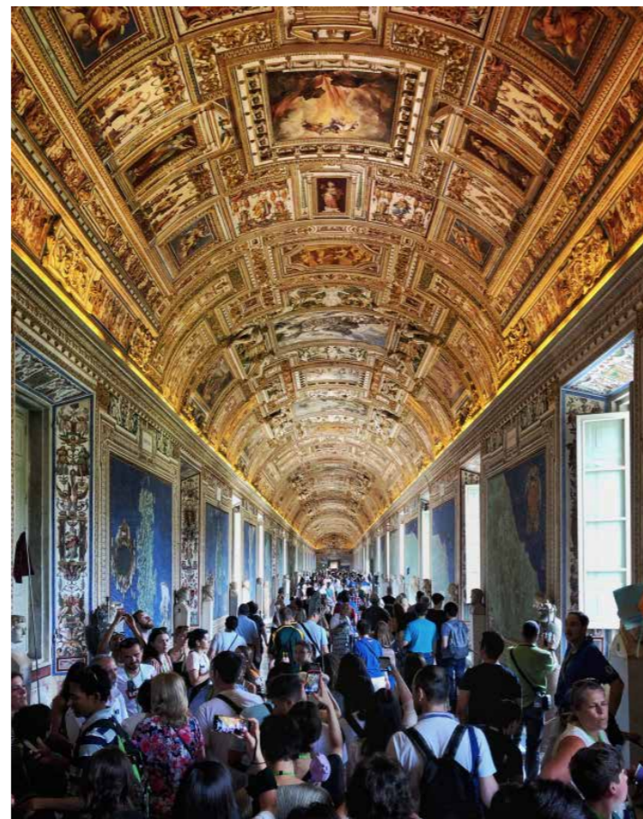
Photo of Vatican City.